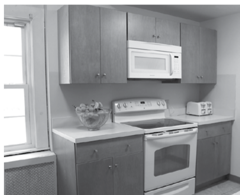
A clean, open kitchen with new appliances creates an efficient and visually pleasing kitchen.

And what a success! Your tremendous generosity produced amazing results.