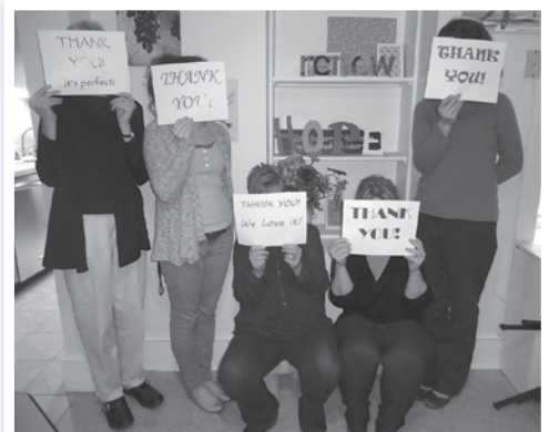
Your generosity created a feeling of warmth, peace, and joy for shelter residents!